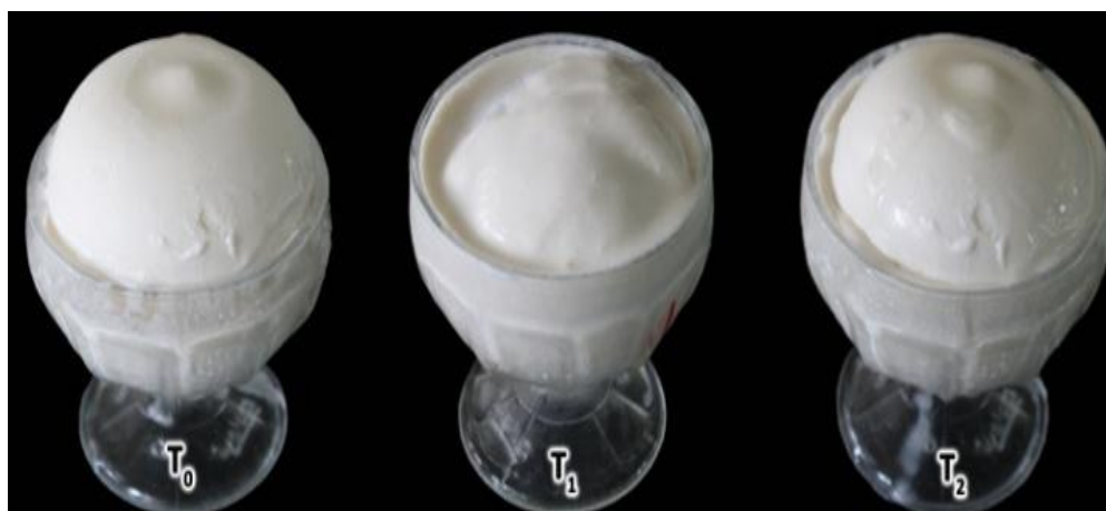
Plate 1. Pulse protein concentrate incorporated ice cream T 0 – Control; T 1 – 5% red gram PPC; T 2 – 5% Bengal gram PPC

The statistical design for physical properties of PPC incorporated ice cream was a completely randomized design (CRD). Data were analyzed statistically by analysis of variance (ANOVA) using AGRES for Window version 10.0. Means with a significant difference (P<0.05) were compared by Least Significant Difference.