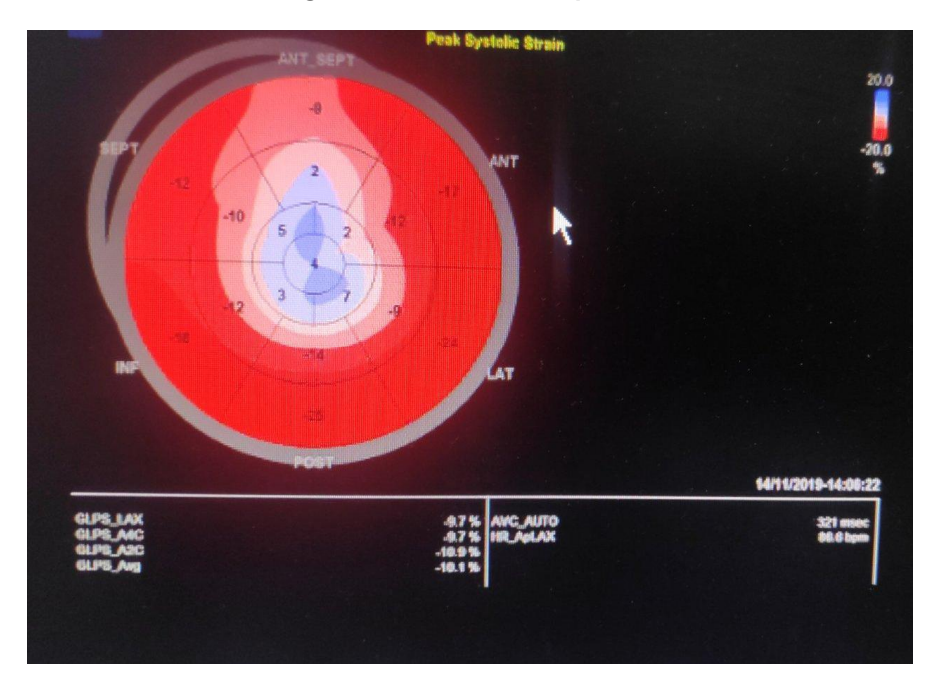
Fig. 2. Global longitudinal strain in takotsubo cardiomyopathy