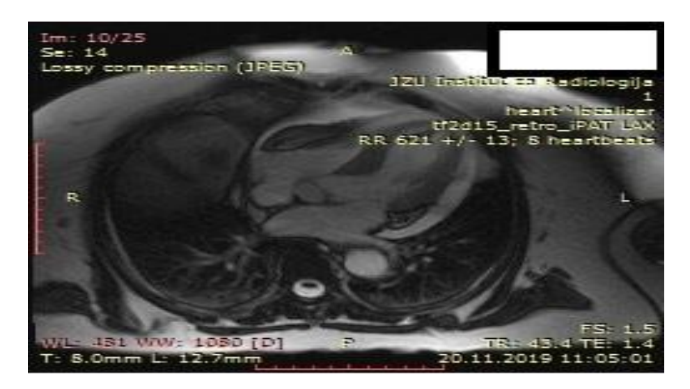
Fig. 3. Magnetic resonance of the heart in takotsubo cardiomyopathy

Andova et al.; AJRCD, 2(3): 11-16, 2020; Article no.AJRCD.59073