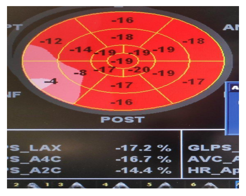
Fig. 5. Global longitudinal strain after 2 months

Reversal of the symptoms and regression of wall motion abnormalities on advance echocardiography at follow up was the key finding in our investigations.