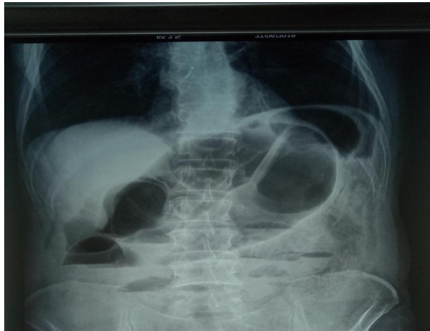
Fig. 1. Abdomen without preparation standing up

Direct referral to the operating theatre after conditioning, and under antibiotic coverage, surgical exploration had found a small intestine volvulus around the sigmoid base in the form of a node, with necrosis of the right colon, of the graft over 2 m at 20 cm from the ileocecal junction and necrosis of the sigmoid loop (Figs. 1,2,3). The patient underwent right hemicolectomy with 2.20 m of the small intestine and sigmoid colon, with terminal ileocolic anastomosis and Hartmann-type left iliac colostomy. The patient stayed in intensive care postoperatively for 3 days, with transfusion of 3 red blood cells and 7 fresh frozen plasma. The postoperative follow-up was simple, and the patient was discharged postoperatively on day 5. Five weeks later the patient was operated on to re-establish colonic continuity.