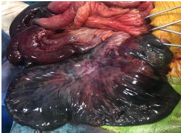
Fig. 4. Intra-operative view after node release