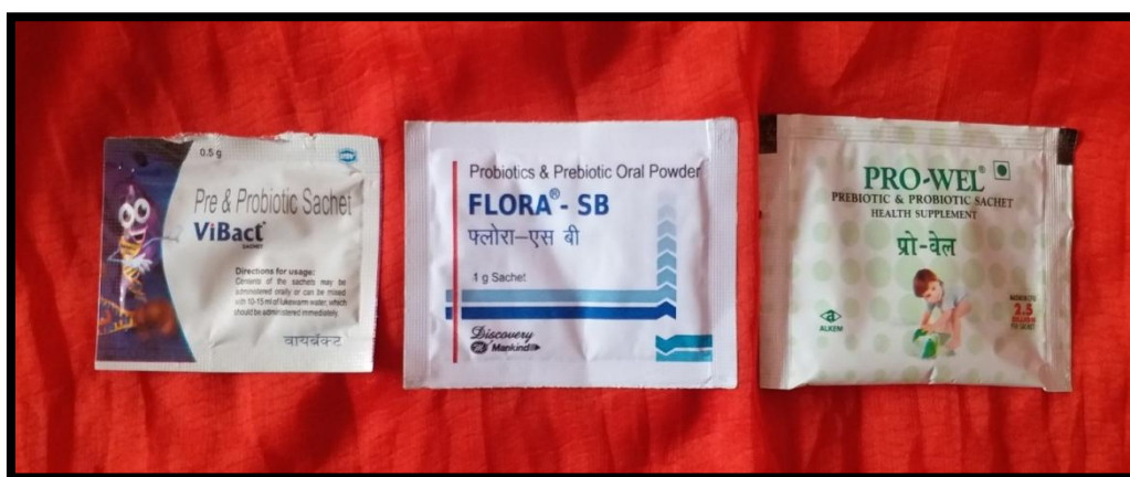
Fig. 1. Commercial probiotics used in the experiment

and inoculated plate. The percent growth inhibition will be calculated using the formula proposed by Vincent (1927).