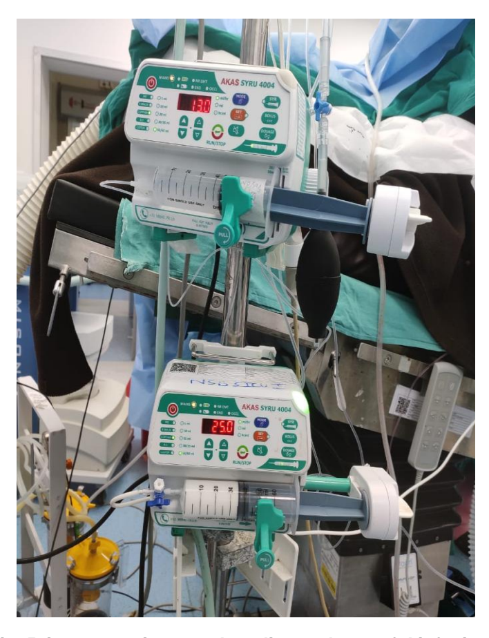
Fig. 5. intraoperative noradrenaline and propofol infusions

As the surgeon planned for facial nerve monitoring, the patient was maintained on inj. propofol infusion at 0.2 mg/kg/hr and Sevoflurane MAC was kept at 0.5 to 0.6 %; inj noradrenaline infusion was started at 4 ml/hr to maintain MAP between 70mmHg to 90 mmHg. All vital parameters were maintained at a stable rate throughout the procedure. Serial arterial blood gases monitoring was done. There was no episode of air embolism through out the surgery which is the most devastating complication in sitting position.