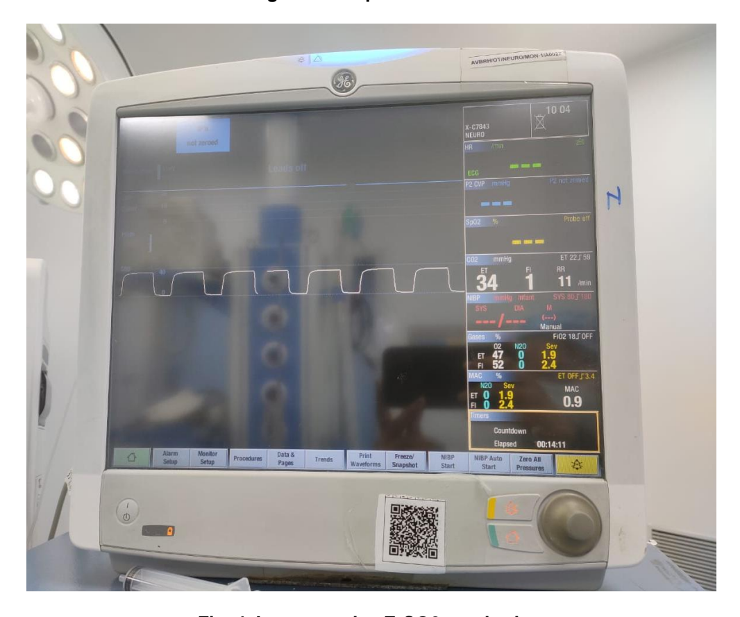
Fig. 4. Intraoperative EtCO2 monitoring