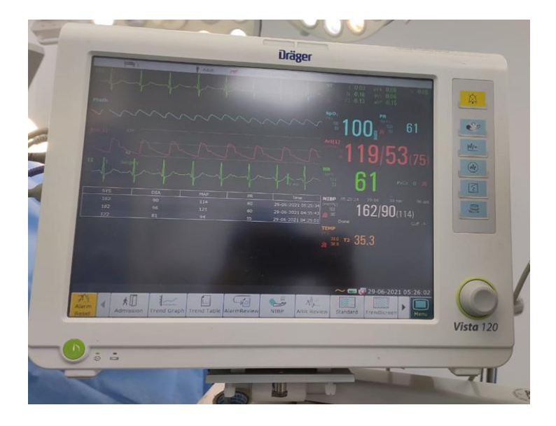
Fig. 3. Intra operative vitals

immobile with respect to each other. Before fixing the frame to the scalp inj. fentanyl 1 mcg/ kg was administered. After final positioning, Arterial line transducer was zeroed at the level of the middle ear. Intraoperative analgesic was maintained with fentanyl 1 mcg/kg/hr.