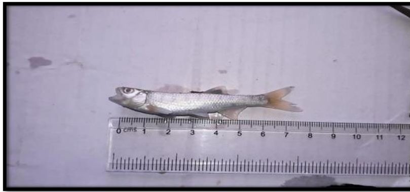
Fig. 7. Barilius vagra