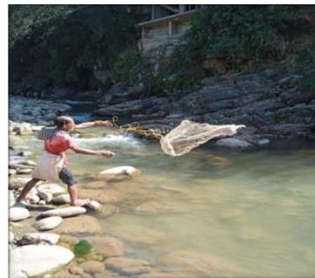
Fig. 2. Fish catch using cast net

Further, distribution of the chromatophores was studied in fish named Labeo boga which was collected with other fishes from same sampling site (Manawar Tawi) in Rajouri district of J&K. The fish belong to class Actinopterygii and order Cypriniformes. The fish is having cycloid scales. These scales are smooth edged, thin, large, round or oval and arranged in overlapping pattern. The middle part of scale which develops initially in cycloid scale is called focus. These scales help in protection of themselves and form an interesting pattern on the fish body. After observing the scales under microscope, the most abundant chromatophores were observed in L. boga . Chromatophores are large and stellate cells that derive from the neural crest [28, 29]. It was also observed that different regions of body have different quantity of chromatophores i.e., the number of chromatophores varies within the body of fish. The difference in the number of chromatophores is due to different genetic makeup of different species.