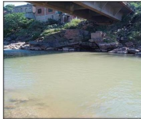
Fig. 1. View of Manawar Tawi

this report would serve as a reference data for future evaluation.