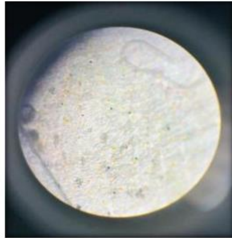
Fig. 9 (b)