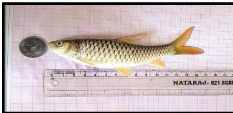
Fig. 5 Tor putitora