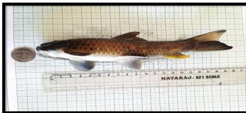
Fig. 4 Gara gotyla gotyla