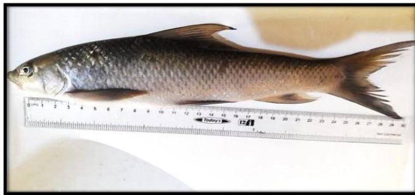
Fig. 8 Labeo boga

Maximum number of chromatophores were found in body and anterior region of L. boga . Chromatophores were also observed in two different states-either in dispersed phase or concentrated phase. The dispersed chromatophores were observed as dendritic shaped cells in different species. The concentrated chromatophores were seen in dorsal region and dispersed chromatophores were seen in the posterior region of L. boga . Later it was concluded that concentrated chromatophores gave light body colour to the fish body and dispersed chromatophores gave dark body colour to the fish body. The pigment dispersion increases body pigmentation and pigment aggregation decreases the body pigmentation [30].