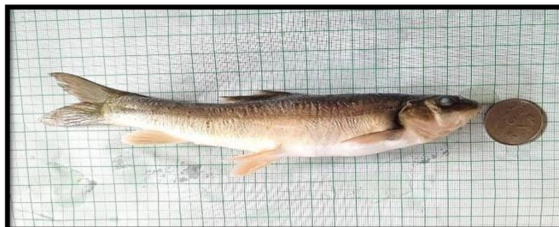
Fig. 6 Oncorhynchus mykiss (Rainbow trout)