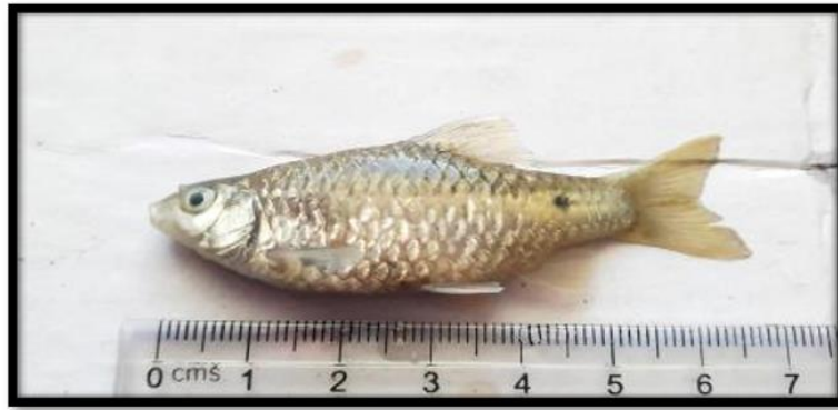
Fig. 3. Puntius conchoni