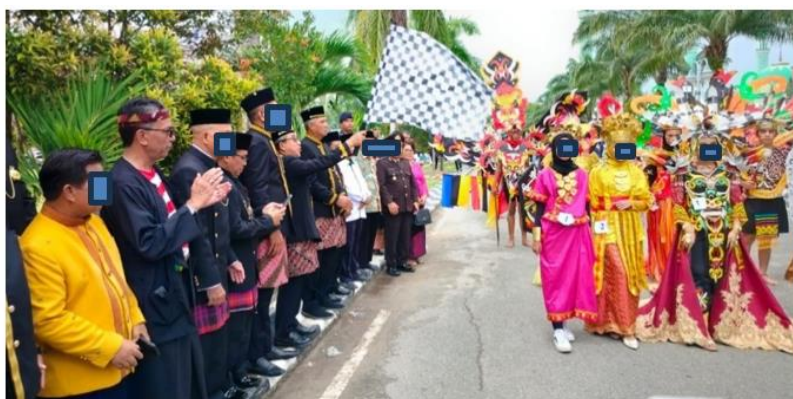
Image 2. Festival of Adat Nusantara Celebration in East Kutai Regency

The collaboration between the Tana Toraja community, local governments, and non-governmental organizations (NGOs) plays a crucial role in sustaining cultural programs, as highlighted in various research papers. External support in the form of financial and logistical assistance enables communities to implement empowerment programs more effectively and on a broader scale, ensuring their sustainability [31,32]. This collaboration signifies a shared dedication to preserving and promoting local culture as a valuable resource for social and economic development, emphasizing the importance of gaining outside support to ensure the continuity of cultural initiatives [33,34]. By working together with external partners, the Tana Toraja community showcases the significance of external backing in maintaining the richness and vitality of cultural programs, ultimately contributing to the overall well-being and prosperity of the local society .