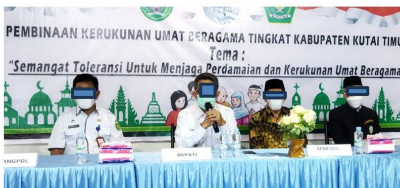
Image 6. District level religious harmony development with the theme: The spirit of tolerance to maintain peace and religious harmony

In the context of multiculturalism, this research underscores the importance of community empowerment in maintaining cultural diversity. By strengthening cultural identity and raising awareness of diversity, the Tana Toraja community in East Kutai contributes to enriching and strengthening social harmony at the local level. An in-depth understanding of the empowerment strategies and challenges faced by the Tana Toraja community can serve as a foundation for policy makers, non-governmental organizations, and other communities in supporting cultural preservation efforts and the promotion of multicultural values. As such, this research has important implications in the context of sustainable development and the maintenance of cultural diversity in Indonesia and around the world.