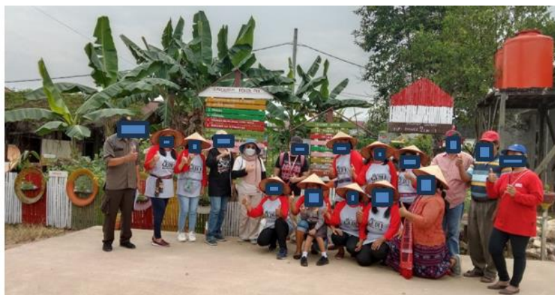
Image 1. Community Empowerment through Education and Training

The active and inclusive cultural education and training approach observed in the Tana Toraja community reflects a dedicated effort towards preserving their cultural heritage by involving individuals of all ages [24]. This strategy ensures a comprehensive transfer of cultural knowledge and values, encompassing Toraja's distinctive dance, music, and crafts, while instilling a deep sense of pride and cultural identity among community members [25]. By engaging children to adults in cultural activities, the community not only passes down traditional practices but also fosters a strong connection to their heritage, laying a solid foundation for cultural preservation and continuity [25]. This emphasis on cultural education plays a vital role in sustaining and promoting the unique cultural identity of the Tana Toraja community [26] a solid foundation for future generations to carry on their traditions and cultural values. Through active participation in cultural activities and training, community members, especially the younger generation, can internalize these cultural values and feel a strong emotional attachment to their cultural heritage. This not only directly supports cultural preservation, but also strengthens cultural identity and solidarity among community members.