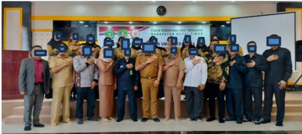
Image 3. The government inaugurated the administrators of Interfaith Youth (PELITA)

Interfaith Women (PERLITA) and Village Harmony Awareness (DSK) for the period 2023-2028.