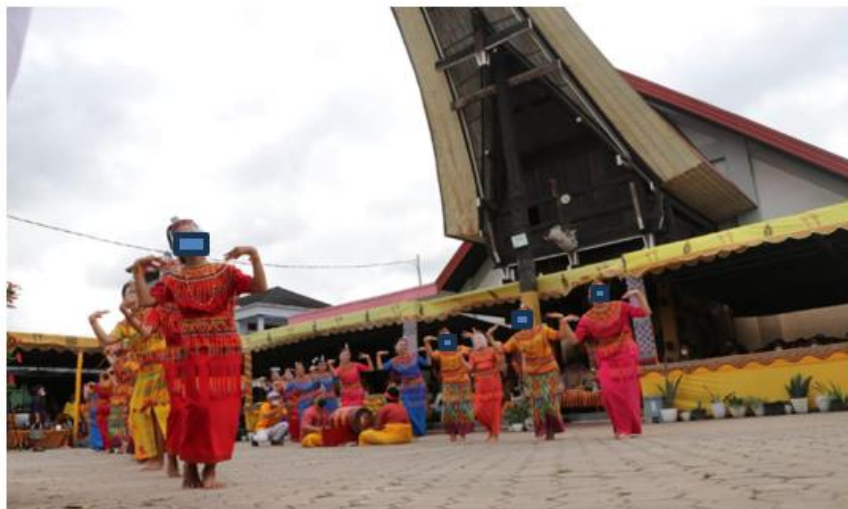
Image 5. Mutlicultural Value Empowerment through traditional celebrations in Tana Toraja Village, East Kutai Regency

Despite the success of many strategies, challenges remain. Limited resources and inadequate support are major obstacles to the implementation of empowerment programs. Internal challenges such as differing views on preserving traditions also need to be addressed with inclusive and participatory approaches. External challenges, especially those caused by modernization and migration, require long-term strategies that involve all stakeholders. By highlighting the challenges faced by the Tana Toraja community, this research provides a solid basis for further reflection and discussion on community empowerment efforts in maintaining multicultural values amidst global change. An in-