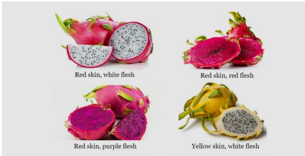
Fig. 1. Species of dragon fruit grown in India Wakchaure et al., 2020