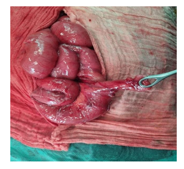
Fig. 2. Meckel's diverticulum (intraoperative photo)