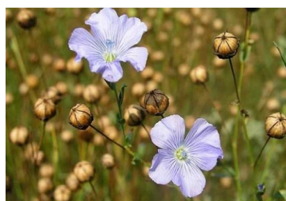
Plate II. Dry flax stalk with capsule and flower