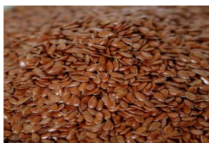
Plate III. Flaxseeds