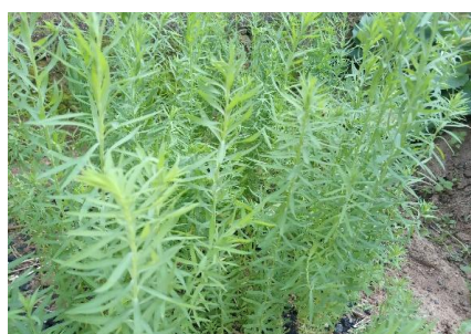
Plate I. Fresh flax plant

frequently may help postpone or even stop the development of diabetes [7]. Omega-3 fatty acids have been associated with enhancements in glycemic and insulin sensitivity [8]. Pre diabetes can be slowed down by ingesting 1-2 grams of long-chain omega-3 polyunsaturated fatty acids daily can impaired glucose intolerance [9,10]. Additionally, adding soluble and viscous fiber to the diet can reduce the glucose response to carbohydrate-rich foods by slowing down gastric emptying and glucose absorption [11]. Flaxseed contains soluble fiber, \alpha -linolenic acid (ALA), and linoleic acid, which are essential omega-3 fatty acids necessary for normal human growth and development [12].