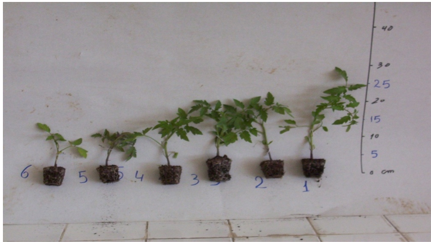
Fig. 2. Effects of spraying tomato seedlings with Dextril on plant height. 1. Control. 2- Dextril 0.02%. 3- Dextril 0.04%. 4- Dextril 0.06%. 5- Dextril 0.08%. 6- Dextril 0.1%

[37] reported that foliar application of cycocel (500 and 1000 ppm) in sunflower increased chlorophyll content significantly over control, this stimulation of chlorophyll content by growth retardants may enhance photosynthesis and consequently, improve shoot and root fresh and dry weight.