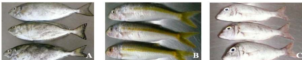
Fig. 1. Showing the morphological features of captured fish species in Hurghada City coastline zone, the Red Sea, Egypt

(A) Marbled spinefoot fish ( Siganus rivulatus ), (B) Yellowfin goatfish ( Mulloidichthys vanicolensis ) and (C) Pinkear emperor fish ( Lethrinus lentjan )