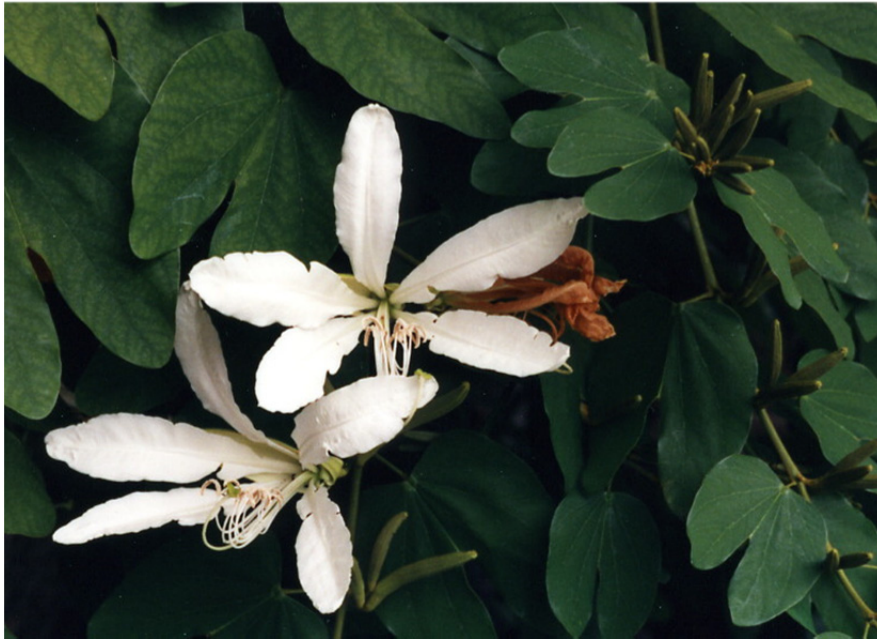
Figure 1. Habitus of B. forficata

Note: The representative image of B. forficata commonly known as “Pata de Vaca”.