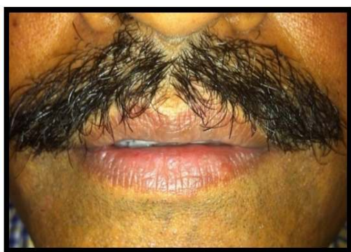
Fig. 3. Postoperative view after 6 months