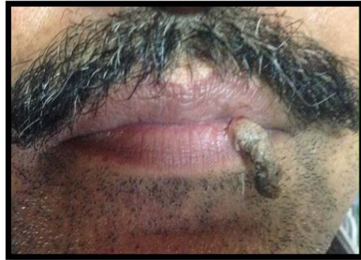
Fig. 1. Preoperative view

compressible, non tender, non reducible, non bleeding and non pulsatile in nature. A provisional diagnosis of hemangioma was made and a differential diagnosis of traumatic fibroma was considered. Routine hemogram was advised and the resultant values were under normal physiological limits.