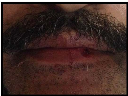
Fig. 2. Immediate postoperative view