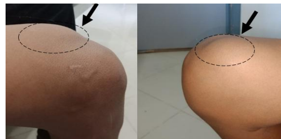
Fig. 2. Venous malformation of the lower end of the right thigh

The CT scan revealed a tumor-like right latero-cervical formation, measuring (67x65x96.8) mm, well defined, heterodense, site of calcifications, heterogeneously enhanced after injection of PDC (Fig. 3).