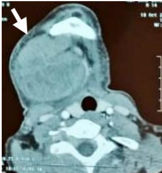
Fig. 3. CT scan results showing tumor-like right latero-cervical formation

Postoperative assessments carried out in our Laboratory, revealed an anemia at 9.1 g/dl with thrombocytopenia at 125,000 elements/mm 3 , with a low prothrombin level at 47%, an increase in activated partial thromboplastin time to 37.5 seconds and a deep hypofibrinogenemia at 0.55 g/l, rechecked on a 2nd sample respecting the pre-analytical conditions. The level of D-Dimer was high, while the level of coagulation factors of the common pathway was normal (DIC ELIMINATED). In front of the deep hypofibrinogenemia and the suspicion of a congenital origin, an assessment was carried out in the parents and the siblings (3 boys and 1 girl), objectifying a normal level of fibrinogen (CONGENITAL ORIGIN ELIMINATED).