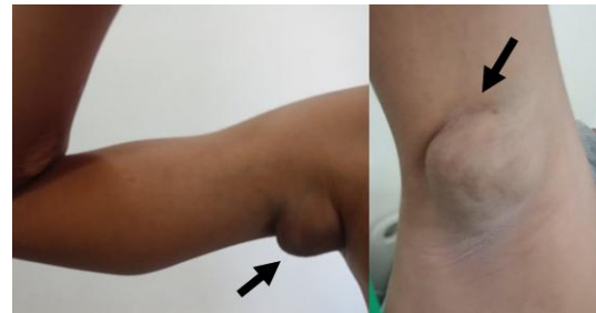
Fig. 1. Venous malformation of the right axilla

axillary, dorsal, lower end of the right thigh, facing the 1st right metacarpal, right inguinal region and right hip (Figs. 1- 2).