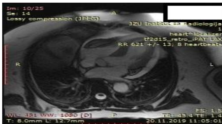
Fig. 3. Magnetic resonance of the heart in takotsubo cardiomyopathy

Patient was treated with single antiplatelet, anticoagulation therapy for the apical thrombus, diuretics, beta blockers and ACE inhibitors for treatment of heart failure with reduce ejection fraction (HFrEF).