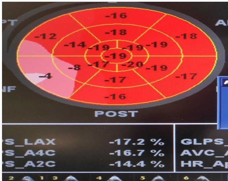
Fig. 5. Global longitudinal strain after 2 months

Reversal of the symptoms and regression of wall motion abnormalities on advance echocardiography at follow up was the key finding in our investigations.