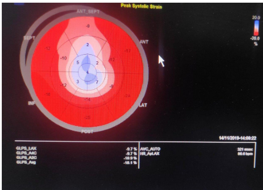
Fig. 2. Global longitudinal strain in takotsubo cardiomyopathy