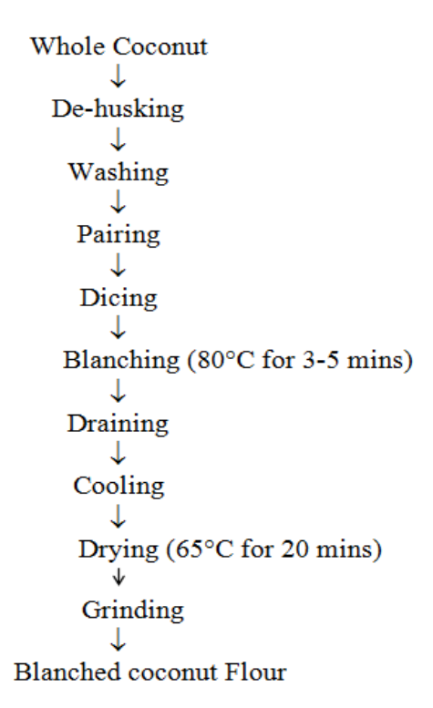
Fig. 1. Flow chart for the production of blanched coconut flour

Table 1 shows the blending ratios for the wheat and blanched coconut flour which are used to produce the experimental samples, while 100% wheat flour was used to make cookies for control.