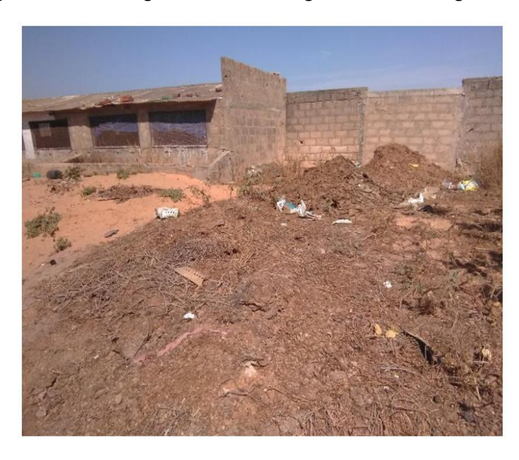
Fig. 2. Manure storage on the farm