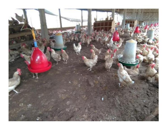
Fig. 1a. Poor bedding condition

53.1% of the farms surveyed are easily accessible to foreigners (visitors and buyers) without any regulation. None of