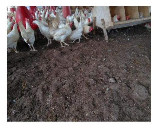
Fig. 1b. Poor bedding condition

The discharge of corpses is done in the majority of farms by burial (68.9%) and in 35.6% of cases the corpses are abandoned in the open air next to the buildings.