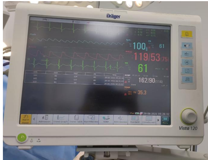
Fig. 3. Intra operative vitals

immobile with respect to each other. Before fixing the frame to the scalp inj. fentanyl 1 mcg/ kg was administered. After final positioning, Arterial line transducer was zeroed at the level of the middle ear. Intraoperative analgesic was maintained with fentanyl 1 mcg/kg/hr.