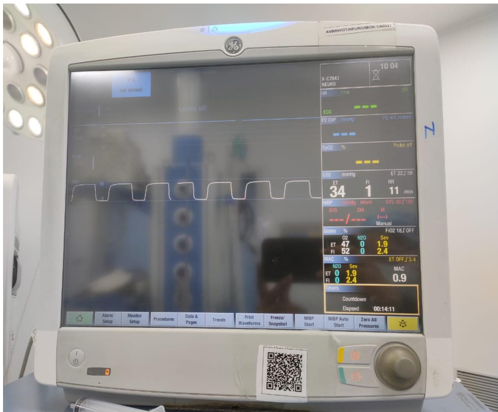
Fig. 4. Intraoperative EtCO2 monitoring