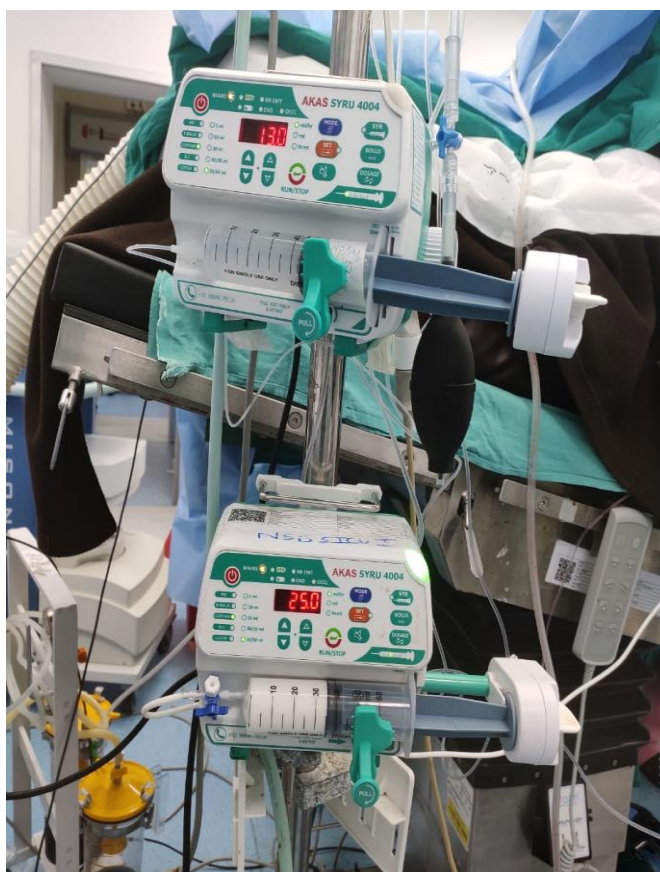
Fig. 5. intraoperative noradrenaline and propofol infusions

As the surgeon planned for facial nerve monitoring, the patient was maintained on inj. propofol infusion at 0.2 mg/kg/hr and Sevoflurane MAC was kept at 0.5 to 0.6 %; inj noradrenaline infusion was started at 4 ml/hr to maintain MAP between 70mmHg to 90 mmHg. All vital parameters were maintained at a stable rate throughout the procedure. Serial arterial blood gases monitoring was done. There was no episode of air embolism throughout the surgery which is the most devastating complication in sitting position.