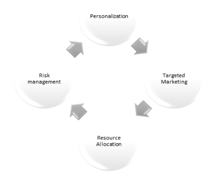
Fig. 3. Impact of customer segmentation (Christy et al., 2021)

Customer segmentation offers different risk techniques that work towards ensuring an appropriate level of functionality at all levels. The customer segmentation offers a channel of providing valuable addition and engagement to