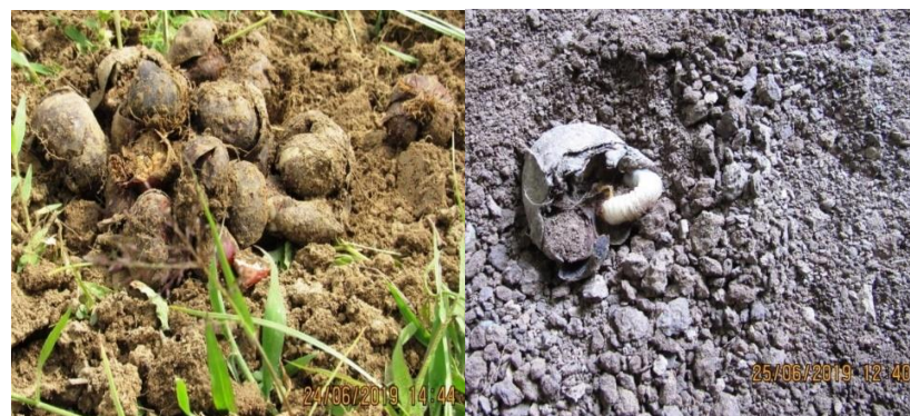
Plate 2. Tulip bulbs infested with white grub