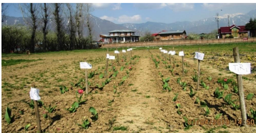
Plate 1. Experiment on bio-efficacy of some granular insecticides against soil arthropods in tulip ( Tulipa gesneriana ) at Urban Technology Park, Habak, SKUAST-K, Srinagar

spacing in four replication (Plat. 1). Four insecticidal treatments viz., Clothianidin 50% WDG @ 300 g a.i./ ha, Thiamethoxam 25% WG@ 80 g a.i./ ha, Imidacloprid + Fipronil 80% WDG @ 300 g a.i./ha and Imidacloprid 70% WG@ 300 g a.i./ ha were incorporated with pulverized soil and thereafter, these were applied in furrows before sowing of the tulip tubers. In case of untreated control, water was sprayed in respective plots. The efficacy of each treatment was assessed on the basis of per cent tuber damage caused by grubs both in weight and number basis also on the number of grubs per square meter at the time of harvest and tuber yield. The tuber damage (weight and number basis) was calculated by following the methodology as Sharma [4] delineated below: