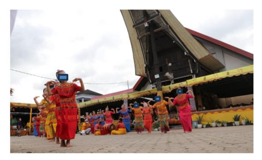
Image 5. Mutlicultural Value Empowerment through traditional celebrations in Tana Toraja Village, East Kutai Regency

Despite the success of many strategies, challenges remain. Limited resources and inadequate support are major obstacles to the implementation of empowerment programs. Internal challenges such as differing views on preserving traditions also need to be addressed with inclusive and participatory approaches. External challenges, especially those caused by modernization and migration, require long-term strategies that involve all stakeholders. By highlighting the challenges faced by the Tana Toraja community, this research provides a solid basis for further reflection and discussion on community empowerment efforts in maintaining multicultural values amidst global change. An in-