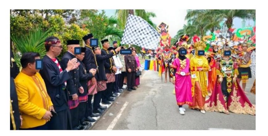
Image 2. Festival of Adat Nusantara Celebration in East Kutai Regency

The collaboration between the Tana Toraja community, local governments, and nongovernmental organizations (NGOs) plays a crucial role in sustaining cultural programs, as highlighted in various research papers. External support in the form of financial and logistical assistance enables communities to implement empowerment programs more effectively and on a broader scale, ensuring their sustainability [31,32]. This collaboration signifies a shared dedication to preserving and promoting local culture as a valuable resource for social and development, economic emphasizing the importance of gaining outside support to ensure the continuity of cultural initiatives [33,34]. By working together with external partners, the Tana Toraja community showcases the significance of external backing in maintaining the richness and vitality of cultural programs, ultimately contributing to the overall well-being and prosperity of the local society.