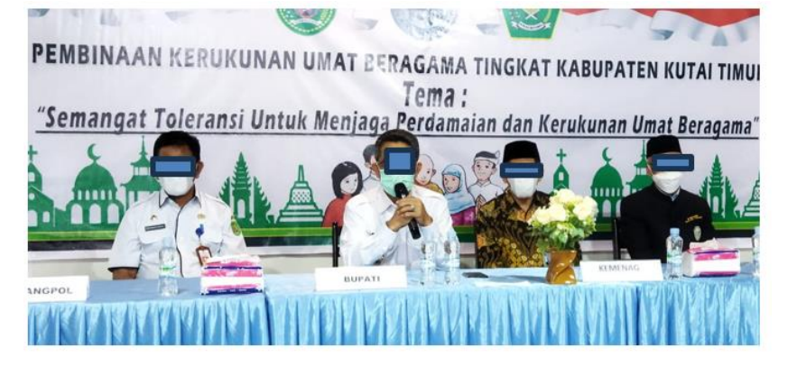
Image 6. District level religious harmony development with the theme: The spirit of tolerance to maintain peace and religious harmony

In the context of multiculturalism, this research underscores the importance of community empowerment in maintaining cultural diversity. By strengthening cultural identity and raising awareness of diversity, the Tana Toraja community in East Kutai contributes to enriching and strengthening social harmony at the local level. An in-depth understanding of the empowerment strategies and challenges faced by the Tana Toraja community can serve as a foundation for policy makers, non-governmental organizations. and other communities in supporting cultural preservation efforts and the promotion of multicultural values. As such, this research has important implications in the context of sustainable development and the maintenance of cultural diversity in Indonesia and around the world.