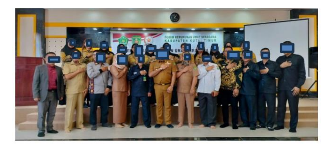
Image 3. The government inaugurated the administrators of Interfaith Youth (PELITA)

Mubarok et al.; Asian J. Educ. Soc. Stud., vol. 50, no. 7, pp. 663-677, 2024; Article no.AJESS.118622