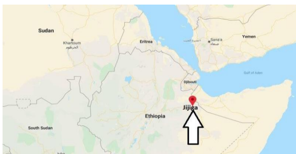
Fig. 1. Map of study area Jigjiga, Eastern Ethiopia [14]

The study was conducted on Jigjiga city. Jigjiga is the capital city of the Somali Regional State which is found on the Eastern part of Ethiopia (Fig. 1) about 630 km and 105 km away from Addis Ababa and Harar towns respectively. Human population size of Jigjiga is estimated about 763,509. Jigjiga is situated at an altitude ranging from 1,660 to 1,710 m above the sea level at geographic coordinates of approximately 9°20' N latitude and 45°56' E longitude. The climate of Jigjiga is semi-arid type which is characterized by high temperature and low rainfall. The mean annual temperature and mean annual rainfall is about 22°C and 543 mm respectively [12]. There is one sub-standard abattoir in Jigjiga city which is owned by Jigjiga municipality and environmental protection office, that aims to provide officially inspected and safe meat (beef, camel, goat and mutton) for consumers. The abattoir has separate compartment to slaughter animals for Christian and Muslim residents on average, 41 cattle for Christian and 20 for Muslims were slaughtered per day and average of 15 camels were slaughtered per day [13].