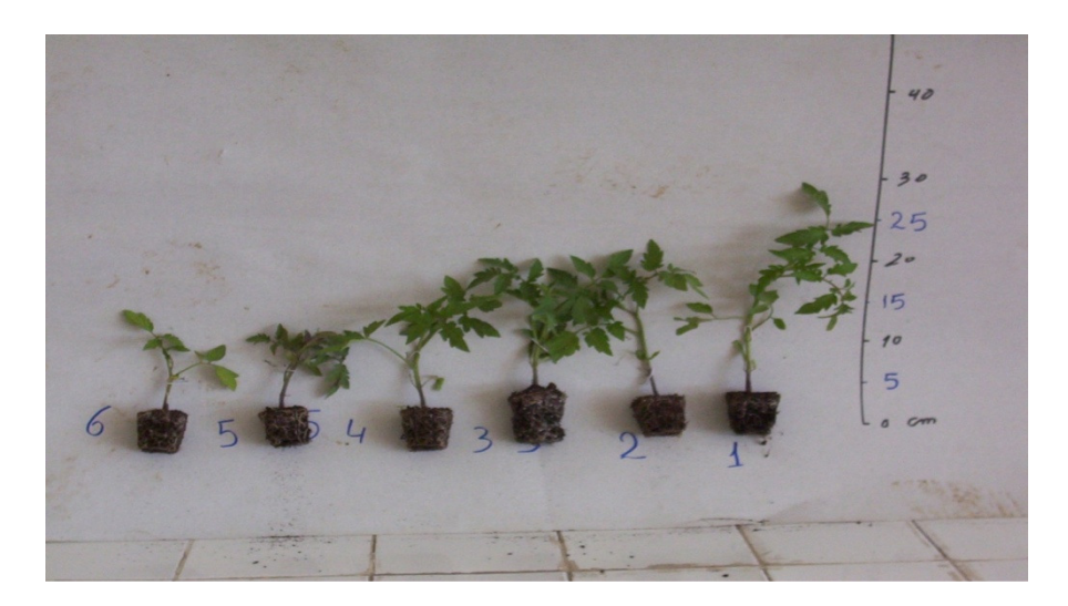
Fig. 2. Effects of spraying tomato seedlings with Dextril on plant height. 1. Control. 2- Dextril 0.02%. 3- Dextril 0.04%. 4- Dextril 0.06%. 5- Dextril 0.08%. 6- Dextril 0.1%

[37] reported that foliar application of cycocel (500 and 1000 ppm) in sunflower increased chlorophyll content significantly over control, this stimulation of chlorophyll content by growth retardants may enhance photosynthesis and consequently, improve shoot and root fresh and dry weight.