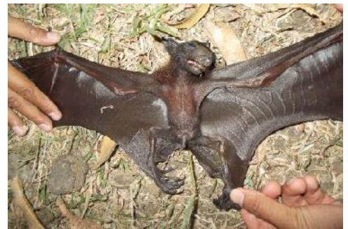
Fig. 3. Cynopterus brachyotis form when flying (left); Cynopterus brachyotis has been captured [5]

Cynopterus brachyotis is at coordinates 5^{\circ} 32 '21,56 "LU; 95^{\circ} 48 '29.53 "BT or within \pm 700 meters of the track plan and \pm 50 meters from the beach. Cynopterus brachyotis which is a frugivora that in his life more rely on the ability of smell than hearing so that not too sensitive to the noise noise. Cynopterus brachyotis only utilizes