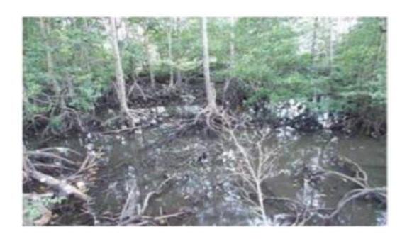
Fig. 6. Mangrove Forest condition in Langsa [13]