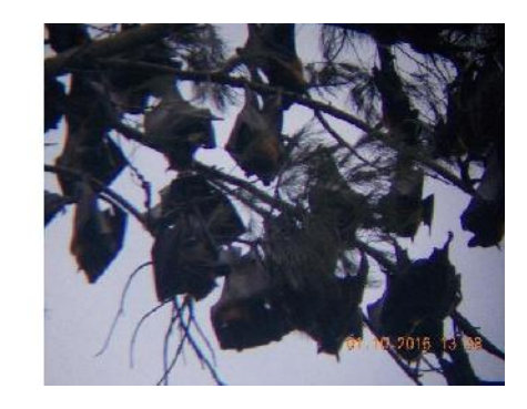
Fig. 5. Pinus Merkusii tree has become Cynopterus brachyotis rest area [13]

In addition to observation of habitat utilization patterns by Cynopterus brachyotis , also conducted data collection on plants and animals found around the habitat of his life. Plant data were done by using 10 x 10 meter sample plot while animal registration was done by VES method (Visual Encounter Survey) [11]. The data of animal and plant type is presented as shown in Table 4.