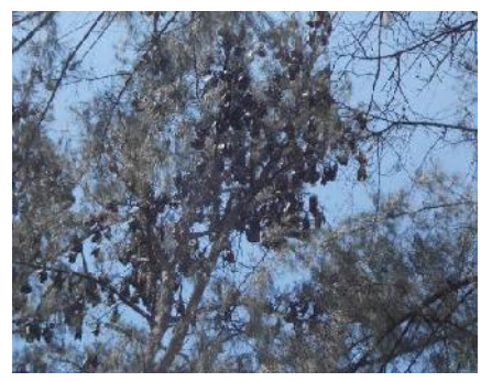
Fig. 2. Cynopterus brachyotis colony that occupies Pinus mercusii tree in Blangraya Village, Muara Tiga Sub-district, District Pidie [5]