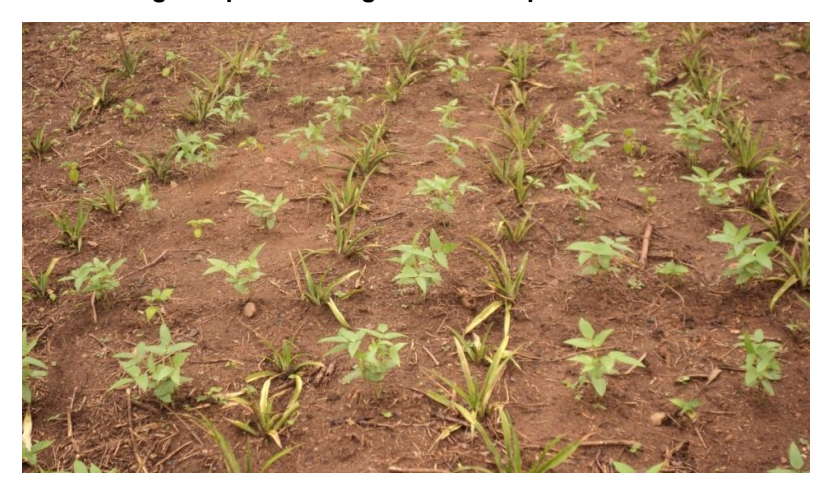
Plate 2. Growth and the physical arrangement of the plot with cowpea sown at the time transplanting of pepper. Annotation with the red dotted line indicated the location of pepper

and 31<sup>st</sup> May, 21<sup>st</sup> June and 2<sup>nd</sup> July 2011, respectively. During the 2012 rainy season experiment, cowpea seeds were sown into the intercropped plots on 19<sup>th</sup> May, 9<sup>th</sup> June, 30<sup>th</sup>