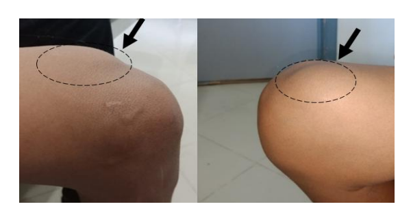
Fig. 2. Veinous malformation of the lower end of the right thigh

The CT scan revealed a tumor-like right laterocervical formation, measuring (67x65x96.8) mm, well defined, heterodense, site of calcifications, heterogeneously enhanced after injection of PDC (Fig. 3).