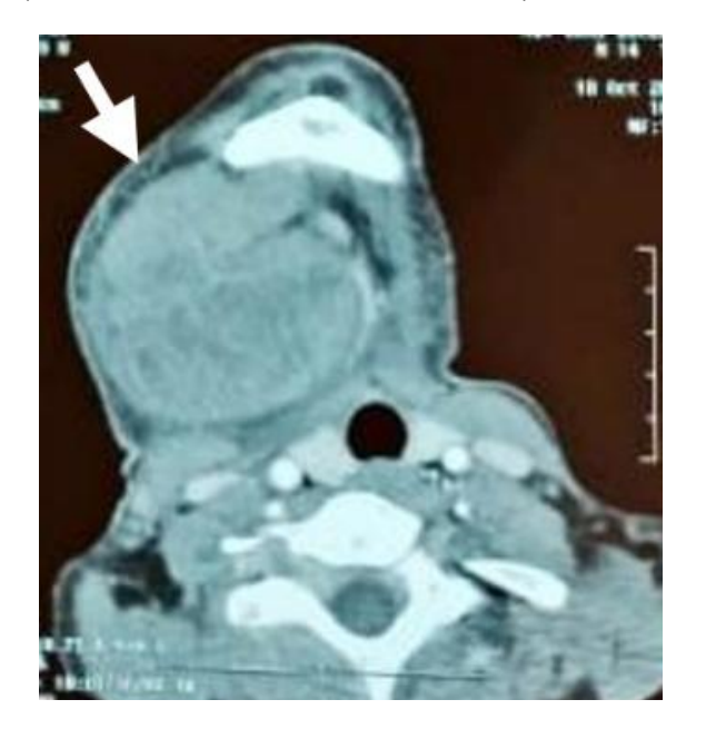
Fig. 3. CT scan results showing tumor-like right latero-cervical formation

Postoperative assessments carried out in our Laboratory, revealed an anemia at 9.1 g/dl with thrombocytopenia at 125,000 elements/mm3, with a low prothrombin level at 47%, an increase in activated partial thromboplastin time to 37.5 seconds and a deep hypofibrinogenemia at 0.55 g/l, rechecked on a 2nd sample respecting the pre-analytical conditions. The level of D-Dimer was high, while the level of coagulation factors of the common pathway was normal (DIC ELIMINATED). In front of the deep hypofibrinogenemia and the suspicion of a congenital origin, an assessment was carried out in the parents and the siblings (3 boys and 1 girl), objectifying a normal level of fibrinogen (CONGENITAL ORIGIN ELIMINATED).